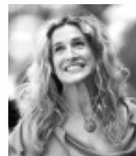
Actor or actress on a popular TV show