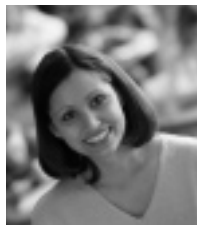
English teacher in a high school